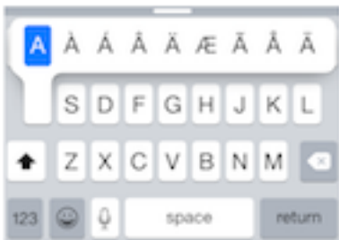
iPhone keyboard Capital "A" international marks