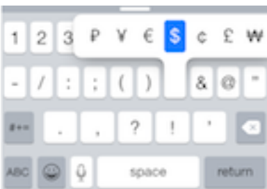
iPhone keyboard dollar ($) international symbols