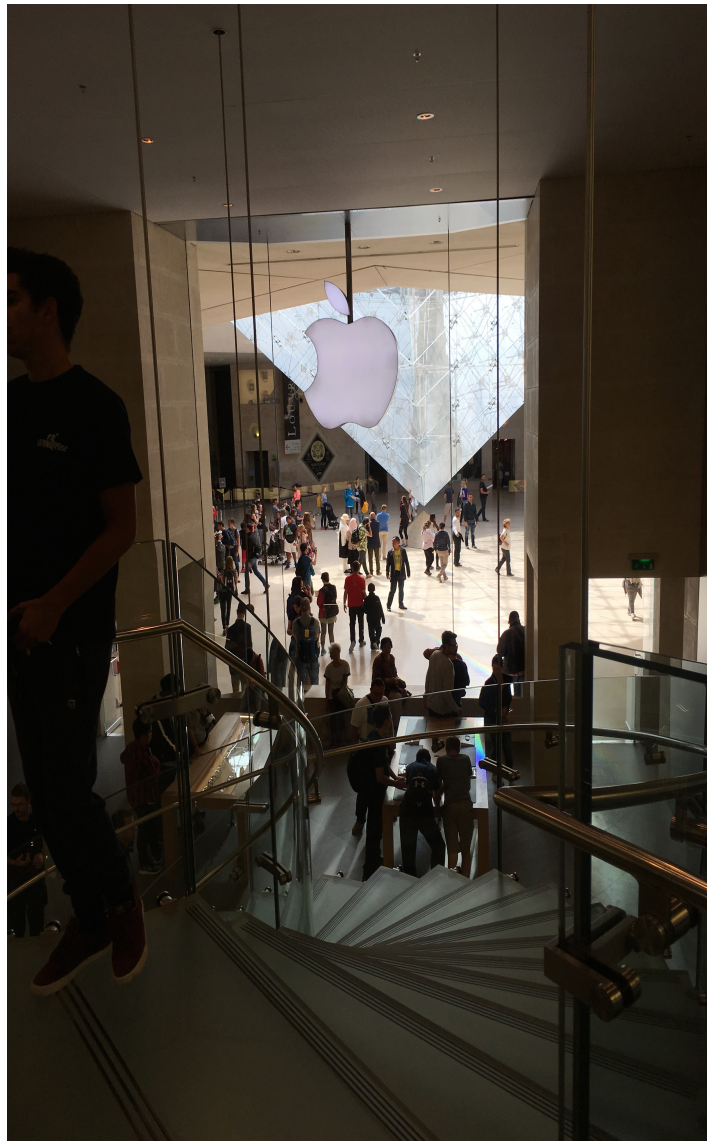
Figure 1. Photo taken from second floor of Louvre Apple store looking out at the Carrousel du Louvre at La Pyramide Inversée

pyramid outside the store in the large open area, the Carrousel du Louvre mall, leading to many venues in the Louvre—the world's largest museum and a historic monument in Paris.