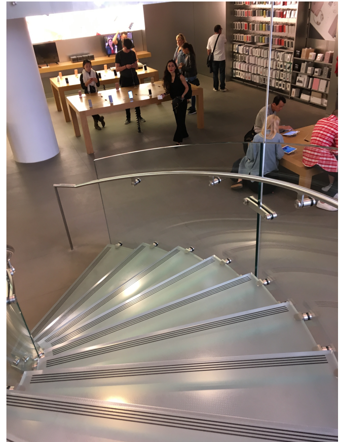
Figure 2. Glass staircase inside Louvre Apple store in Paris

https://www.youtube.com/watch?v=hUKewiA-vIKz87TOAhUX02MKHR09Bt0QsAQIJA&biw=1072&bih=445