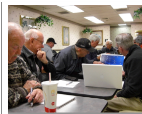
MacHelp meeting at McDonalds on February 27, 2008

assembled and our club experts offered solutions to several Mac users including installing an update to a financial program and suggesting a way to set up the Parallels program on the Mac to use a PC Windows Bridge game. A new Mac user also attended the meeting needing help getting started on his new Macintosh laptop. As you can see from the photos, this is a very informal help session. Those who ask for help are referred to the person who can help; often there are several help groups going on simultaneously. We suggest that particular problems be referred to the club before the meeting so our experts can be prepared. Members don't need to have a problem to attend. Just come and learn.