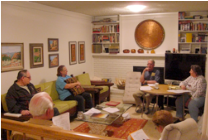
DAPI Board Meeting, April 4, 2010