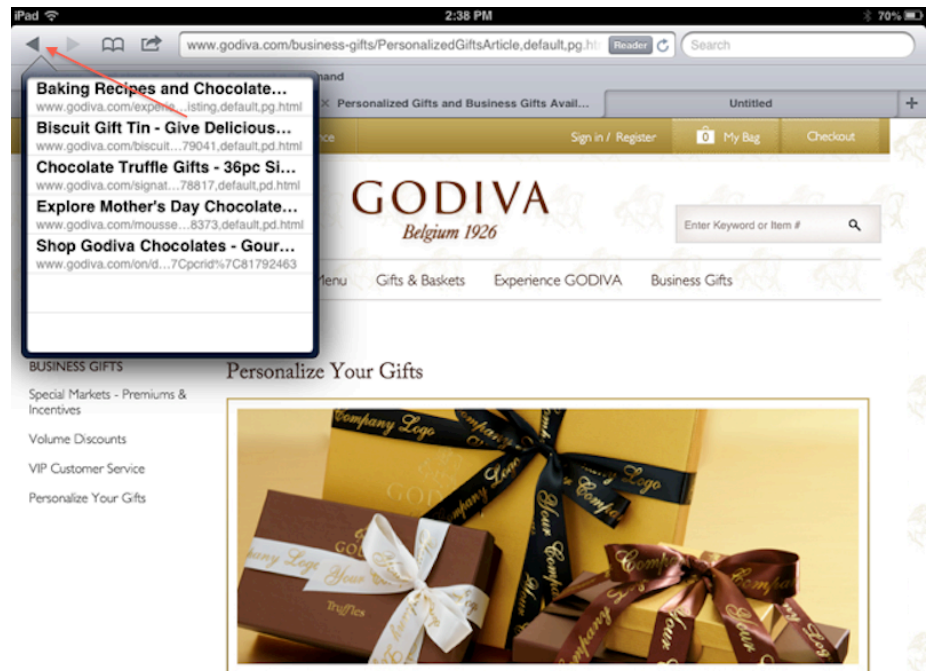
Figure 1. Arrow at top left for iPad

Open Safari on your device and start browsing the web. Go to a few of your favorite sites. When the arrow(s) appears indicating you've been on several different sites, put your finger on the arrow until a menu pops up and select whichever site you'd like to go back to.