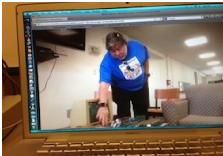
Steve Wozniak (shown at KansasFest Q&A session)

There will be no DVD available of this presentation. A technical glitch prevented video and sound recording.