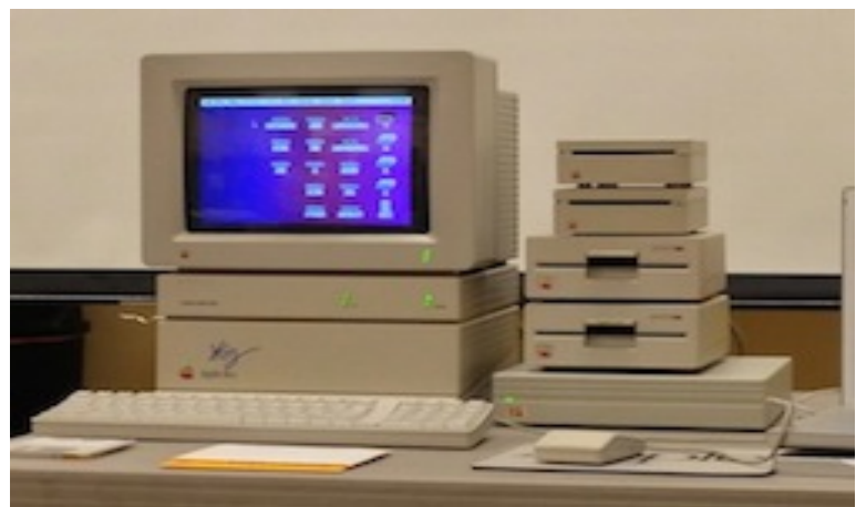
Tammy's Apple II GS set up at DAPi meeting. Note "Woz" signature just above keyboard!