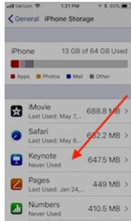
Figure 1. Delete apps you don't need.

sage is the same—free up space on your iOS devices. The graph that is displayed takes some time to calculate. Then, in color, it shows how memory is used and makes it easier for you to get rid of stuff you no longer need.