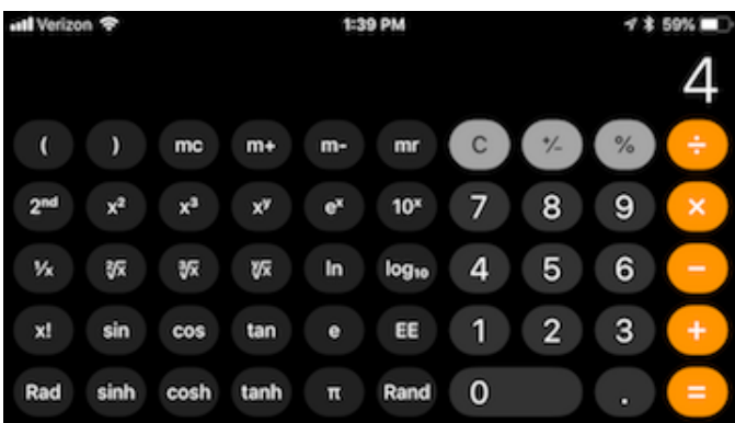
Figure 4. Turn iPhone to landscape for a scientific calculator.

If you're in an area where you should have cell phone service but don't, put your phone on airplane mode and then switch back. This will cause your phone to register and find all the towers in the vicinity.