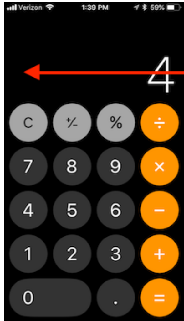
Figure 3. Swipe left (twice) to erase the 5 and then the 8.