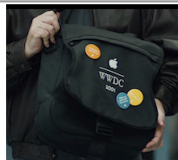
Figure 1. WWDC 2018 attendee with WWDC 2001 Backpack

The final version macOS Mojave will be available for the public to download in September or October 2018. The developer beta