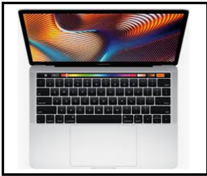
MacBook Pro with Touchbar

Writer Jessica Lanman comments at the end of the MacBook Pro review that Consumer Reports initially failed to recommend the MacBook Pro on their December 2018 issue, but following an Apple upgrade in Safari Software in January 2019 the battery life of the MacBook Pro 13-inch with the Touch Bar was significantly upgraded to at least 15.75 hours; the 15-inch with Touch Bar went to 17.25 hours on a single charge. (Note: without the Touch Bar the 13-inch MacBook Pro consistently averaged 18.75 hours on a single charge. After the Safari software upgrade, Consumer Reports upgraded their review of the three MacBook Pros to "recommended.")