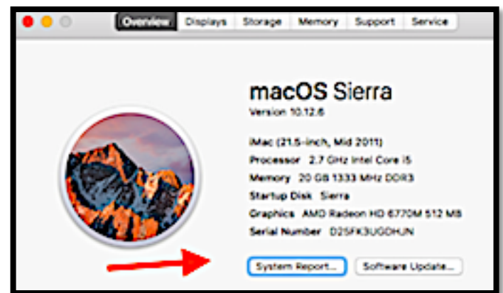
System Report from your MacOS

Of course, you can use your system report built into your MacOS, but it doesn't keep track of upgrade costs. As Apple says, "The technologies that define today's Mac experience—such as Metal graphics acceleration—work only with 64-bit apps." To ensure that the apps you purchase are as advanced as the Mac you run them on, all future Mac software will eventually be required to be 64-bit.