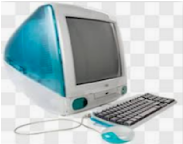
1998 New Look iMac G3

can bet that the team really is both brilliant and passionate.