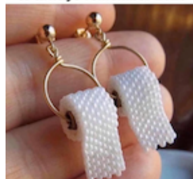
Translation: The New Hard Currency