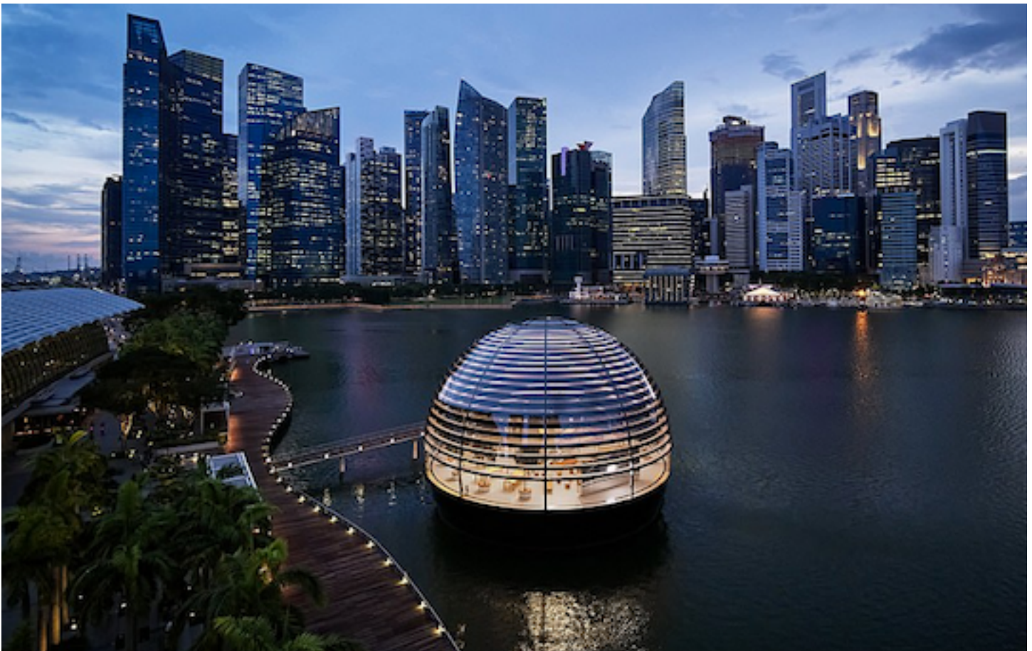
"Floating" Apple Store in Marina Bay Sands -Singapore

There is an underwater boardroom where entrepreneurs and developers can meet with Apple team members. There is also an elevated boardwalk and an underwater tunnel connecting to the shops at Marina Bay Sands.