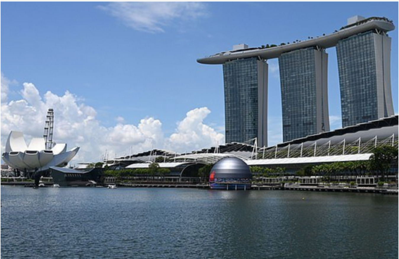
Marina Bay Sands Hotel and Apple Store - Singapore

Weather conditions in Singapore: Year-round showers; a surprising amount of lightning strikes; and heavy humidity. Being tiny, and only 1.5 degrees from the Equator, Singapore enjoys a tropical climate that is almost unceasingly warm and humid all year long. Take quick-drying lightweight clothes, waterproof jacket and umbrella. Don't take raincoat; humidity makes them miserable to wear. Take light jacket for extended periods spent in air-conditioned locations.