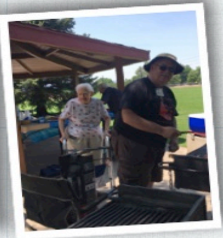
Denver Apple Pi Annual Picnic 2021